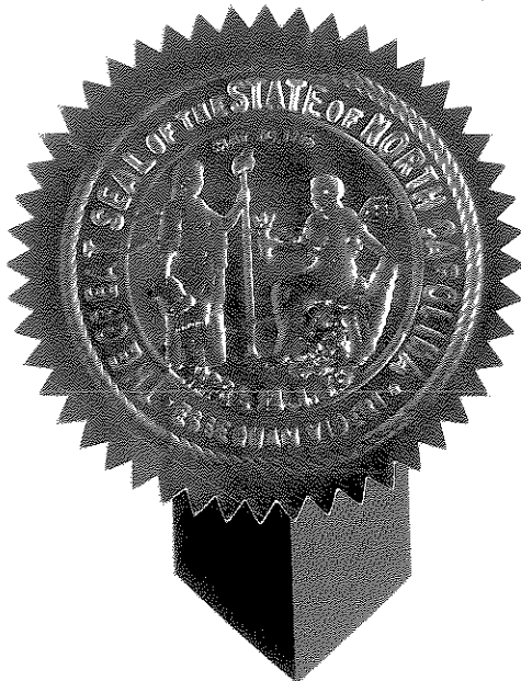
Beverly Eaves Perdue Governor

IN WITNESS WHEREOF , I have hereunto signed my name and affixed the Great Seal of the State of North Carolina at the Capitol in the City of Raleigh, this third day of March in the year of our Lord two thousand and nine, and of the Independence of the United States of America the two hundred and thirty-third.