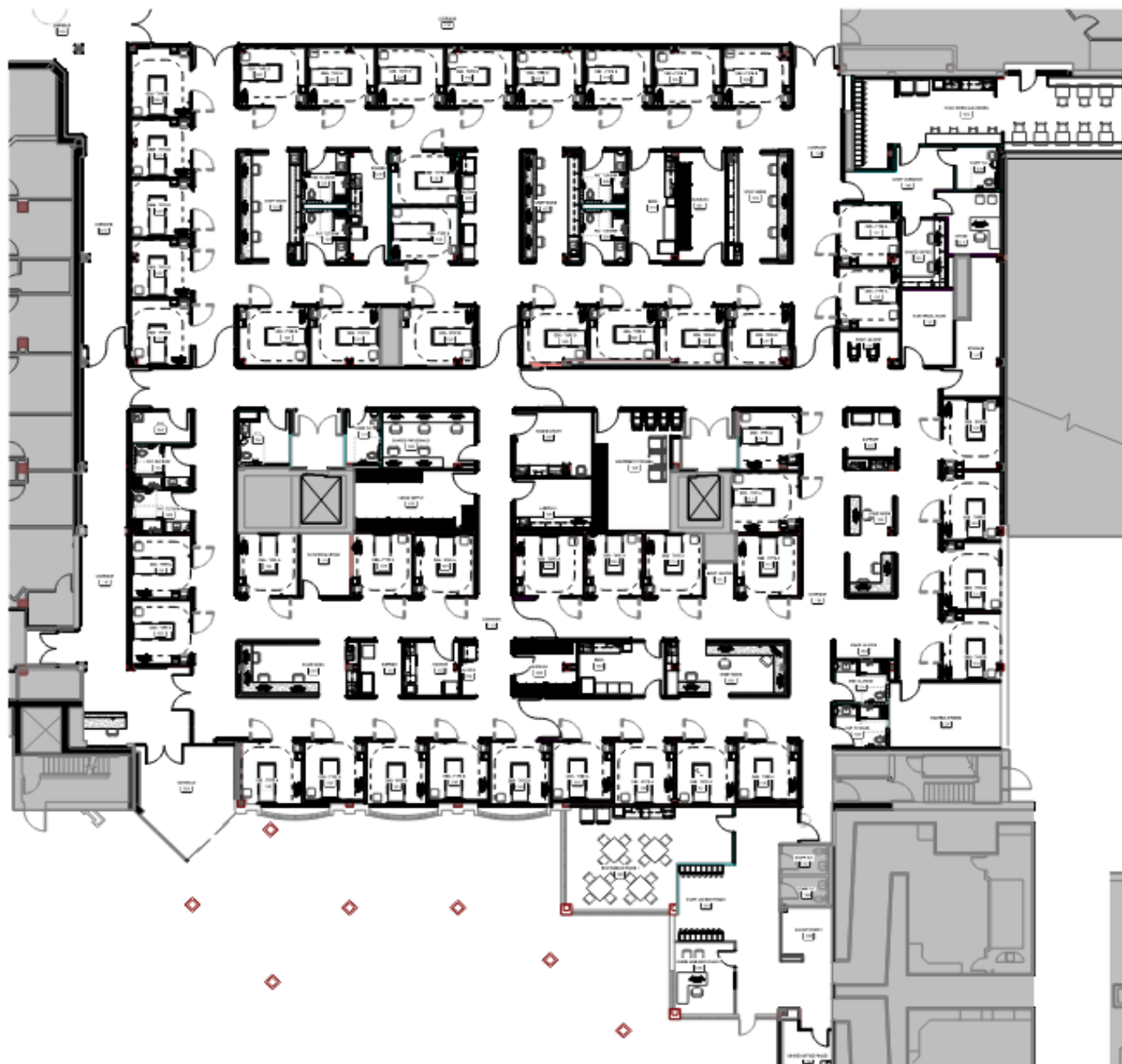
NH PMC Observation Unit