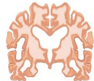
Severe Alzheimer's Disease